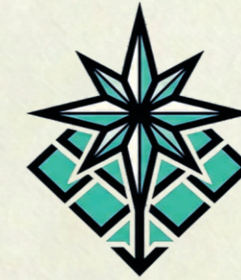
CHART YOUR COURSE TO PREMIUM LIVING